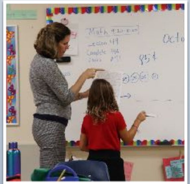
One of our teachers helps a student during an in-class math activity.

Students - in every grade - take on-level math and reading classes. Moving around for these classes means our school sometimes feels like a college campus. No one knows if you're going "up" or "down" as you change rooms. Our math and reading classes are offered at the same time for all grades. This approach gives students opportunities to have challenges in their core courses, while recognizing that age - or grade - is often the most appropriate place for their emotional and behavioral development.