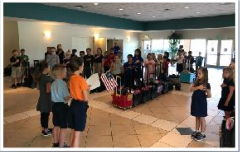
Lower School students gather for morning assembly, when they say pledges, recite the school Bible verse and pray before being dismissed to class.

Classical Christian Academy is a covenant school. Our families are all actively involved in a local church. This means we are a community of parents, students and teachers who are not only like-minded in terms of our Christian beliefs, but in our common interests, desires and application of biblical truth as it relates to marriage, family, child-rearing, and goals. This doesn't mean we're perfect. But, when (not if!) we do have a conflict, we have a common set of beliefs to meet at and from which to grow.