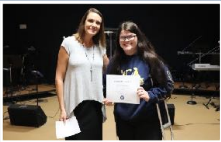
At monthly chapel services, all CCA teachers have an opportunity to present Character Awards to recognize the hard work students do to be more like Jesus.